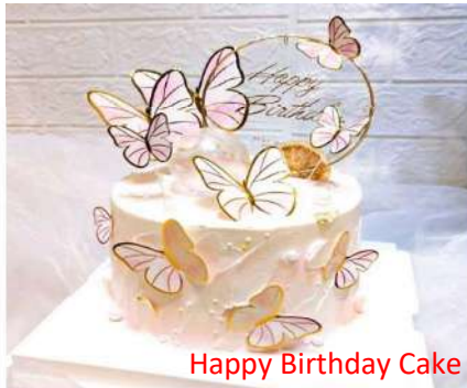
Happy Birthday Cake