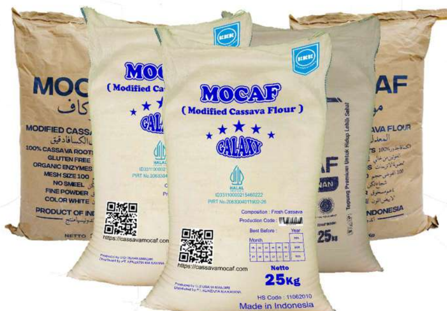
Bulk Packaging 25 Kg

( for Sampel Purpose only and Domestic Sales )