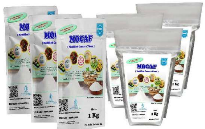
Packaging 1 Kg

( for Sampel Purpose only and Domestic Sales )